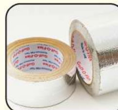
Aluminium FSK Tape