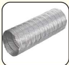
Semi-Rigid Flexible Aluminium Duct