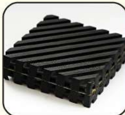
Metal Sandwich Pad