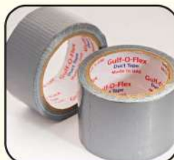
Duct Cloth Tape