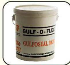
Sealant 30-36 & 30-36 AF (Canvas Coating)