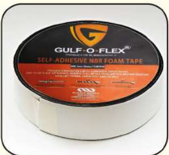
Self-Adhesive NBR Foam Tape