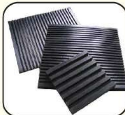
Full Ribbed Rubber Pad