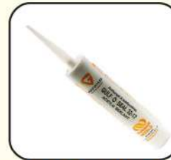
Sealant 32-17 (Acrylic Sealant)