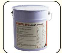
Glue 81-10 (AC Duct Adhesives)