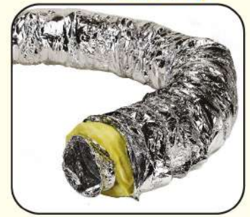
Flexible Insulated Duct