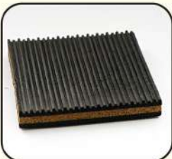
Rubber Cork Pad